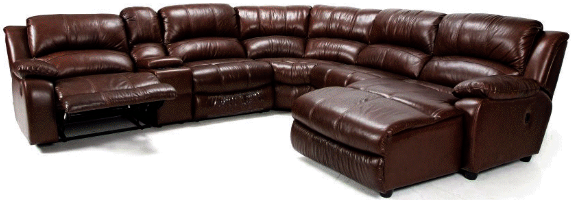
2858-BREAK OUT RECLINING SECTIONAL HEIGHT:39"